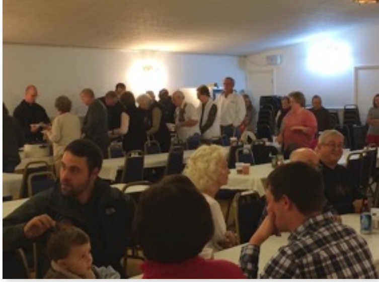
Council #15681 Lawrenceburg